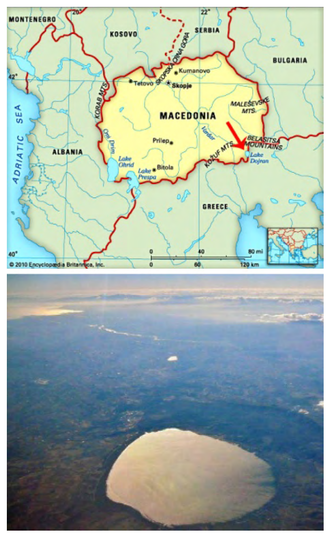
Figure 1. Map of the Republic of Macedonia and its position in Southern Europe (the location of Lake Dojran is indicated by a red arrow), with aerial photo of the lake's position near the Vardar River and Thessaloniki bay.

(1972). In his research, Professor Stojanov followed the annual phytoplankton cycle and dominance of specific taxa in the overall plankton community. This work increased the known number of algal taxa in the lake's plankton to 133, and also documented the succession of diatoms, blue-green algae and green algae over the year. One of the specific findings was the dominance of Ceratium hirundinella (O.F.Müller) Dujardin in winter samples.